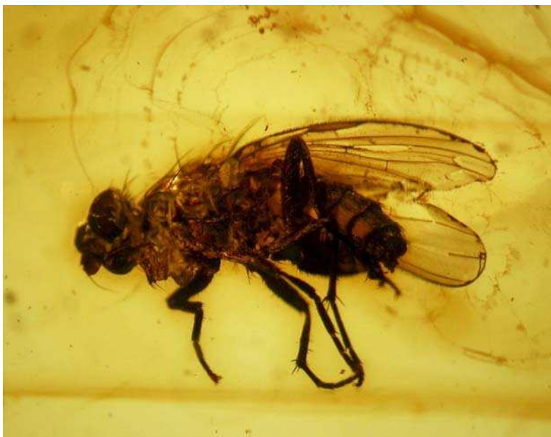
Fig. 5. Sciomyzidae (Diptera: Acalyptratae), cf. Phaeomyiinae, female, coll. 1104-4.

Next to the dipteran inclusion a minute collembola is embedded. The springtail inclusion is totally destroyed; head with eyes and abdomen disconnected from the thorax, eyes with body transparent, furca and antenna faint, diagnostic details not discernible.