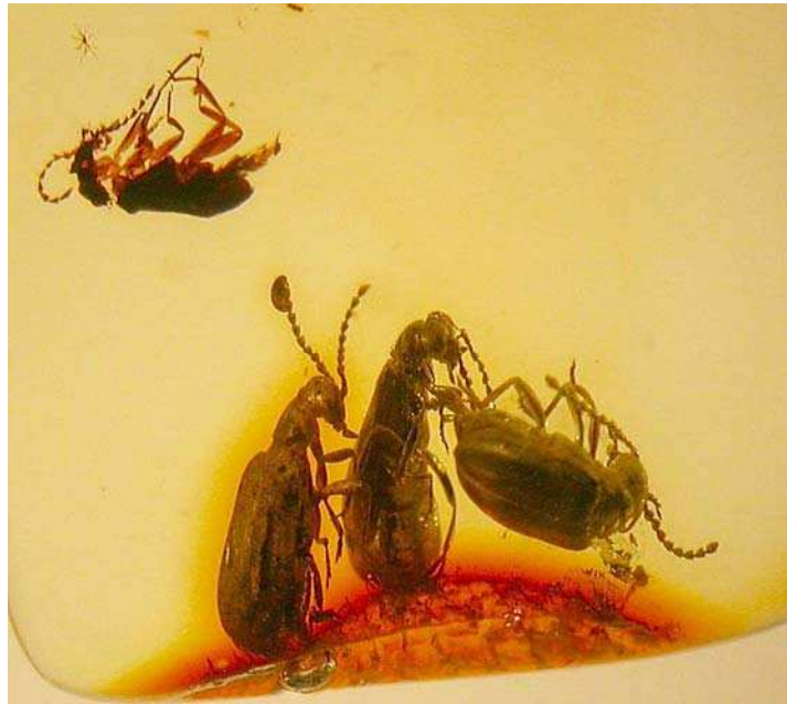
Fig. 9. cf. Pythidae (Coleoptera), 4 specimens, coll. 1588-2