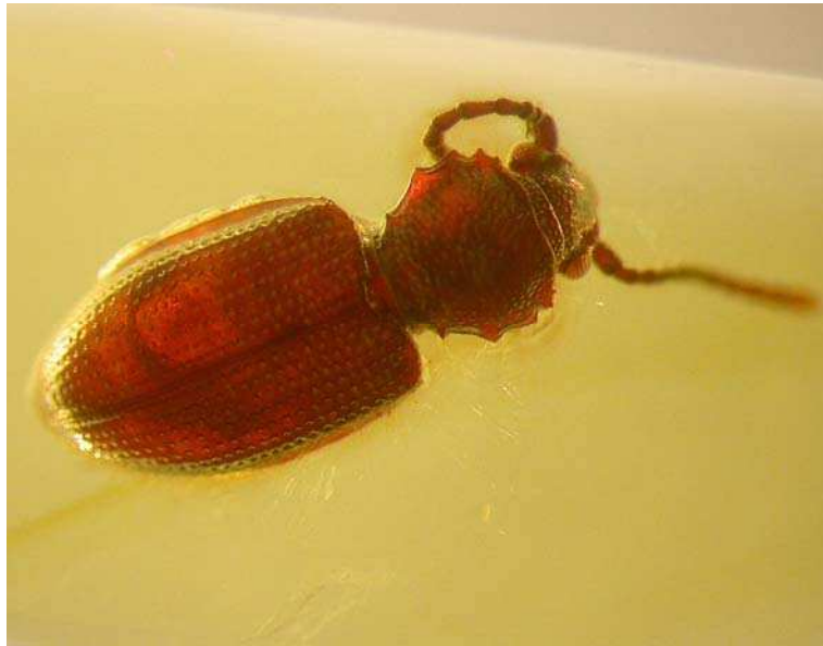
Fig. 1. Silvanidae (Coleoptera), undescribed sp., dorsal habitus, showing a vivid preservation in natural amber, coll. 1698-4.

inclusions on one side, or more or less totally and around body openings such as spiracles, terminalia and mouthparts. It is assumed that the milky emulsion is caused by the decomposition of gases or general moisture surrounding the embedded organisms, not exclusively found in insects and other arthropods but also in plants and plant debris. The phenomenon was discussed in detail by SCHLÜTER & KÜHNE (1975) and MIERZEJEWSKI (1978).