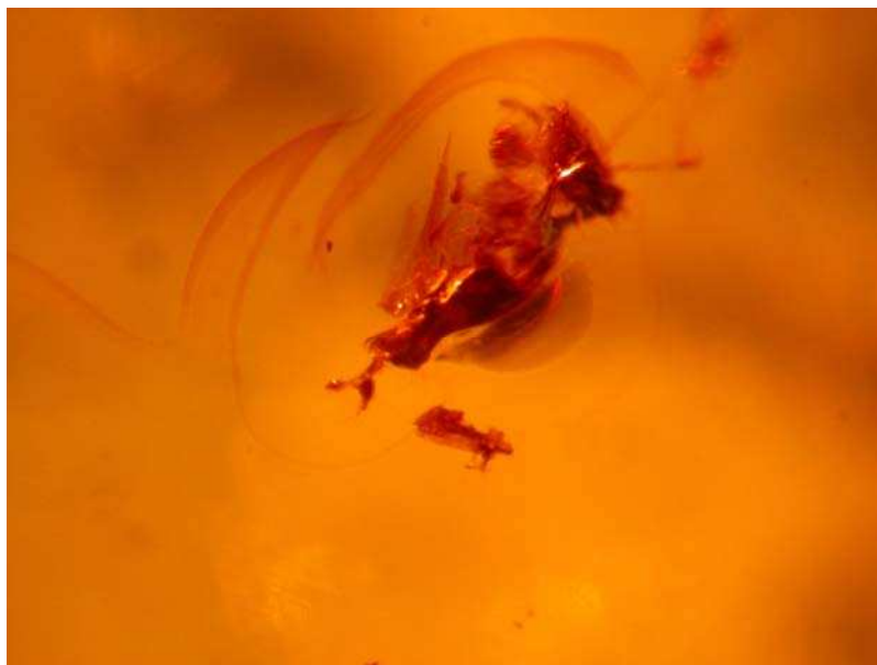
Fig. 6. cf. Sminthuridae (Collembola), syninclusion, coll. 1104-4.

Autoclave processing caused serious modifications; identification to family level depends on the general habitus of the collembolan fragments.