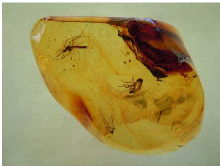
Fig. 13. Amber with Culicidae and Pipunculidae, coll. 1119.

Identification possible to family level due to the characteristic ventrally bent oviscape present exclusively in Pipunculidae.