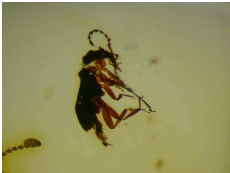
Fig. 10. cf. Pythidae (Coleoptera), roasted specimen, lateral habitus.