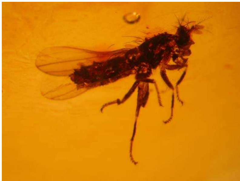
Fig. 17. Incertae sedis (Diptera, Acalyptratae), female, lateral habitus, coll. 1671-3.

The combination of plumose arista and 4 strong peristomal setae is present in Anthoclusia gephyrea within Clusiidae (HENNIG 1965) and in Procyamops succini within Perisclididae (HOFFEINS & RUNG 2005). As the other main diagnostic characters are destroyed or not discernible, placement either in Clusiidae or Perisclididae thus remains speculative.