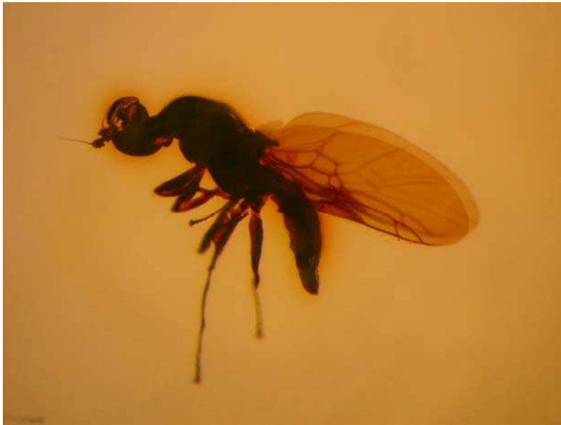
Fig. 7. Stratiomyiidae (Diptera), Pachygastrinae, autoclaved female, lateral habitus, coll. 1350-2.