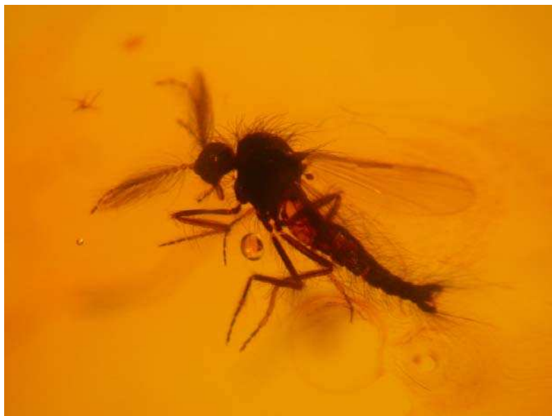
Fig. 3. Ceratopogonidae (Diptera: Nematocera), Forcipomyia sp., male, coll. 179-2.

Autoclave processing did not cause serious alterations.