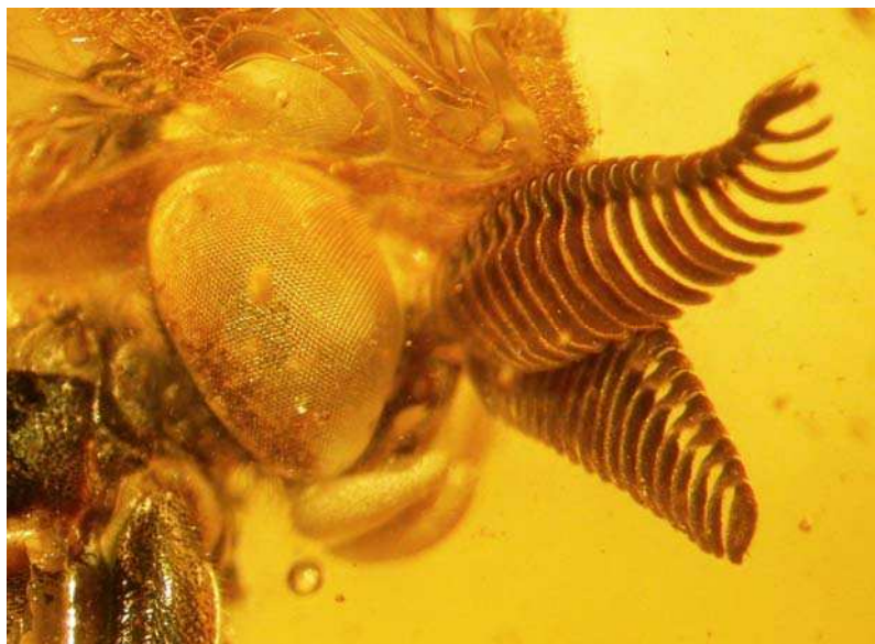
Fig. 12. Rachiceridae (Diptera, Brachycera), Electra formosa , male, head with antenna, natural amber, coll. 1104-4.