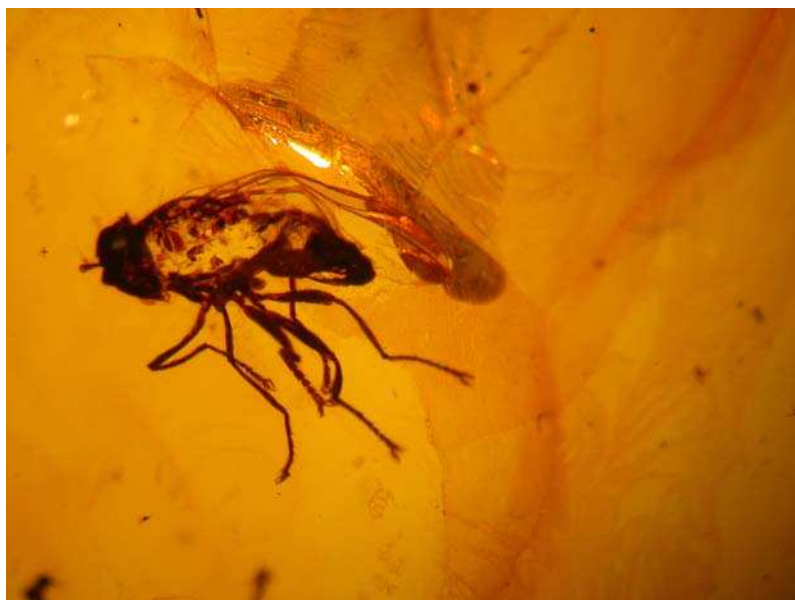
Fig. 15. Pipunculidae (Diptera), female, habitus.