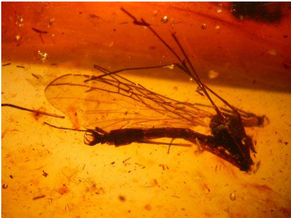
Fig. 4. Mycetophilidae (Diptera: Nematocera), Mycomyia sp., male, coll. 1735-4.

The cracks and breakages in the wing membranes and the antenna do not appear natural and most probably result from the autoclave process as wings of a recently trapped insect would still be flexible in soft resin.