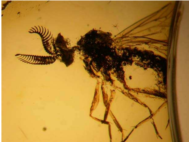
Fig. 11. Rachiceridae (Diptera), cf. Electra formosa , autoclaved ?male, habitus, coll. 1398-1.