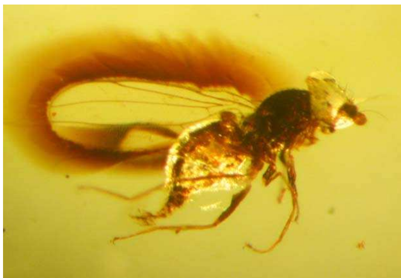
Fig. 2. cf. Asteiidae (Diptera: Acalyptratae), female, treated in an autoclave, coll. 668-4.

has to be taken into account, especially when identifying Diptera placed in the section Acalyptratae (VON TSCHIRNHAUS & HOFFEINS 2009). The integument of the legs becomes transparent so that mummified fragments are visible as thin black strings.