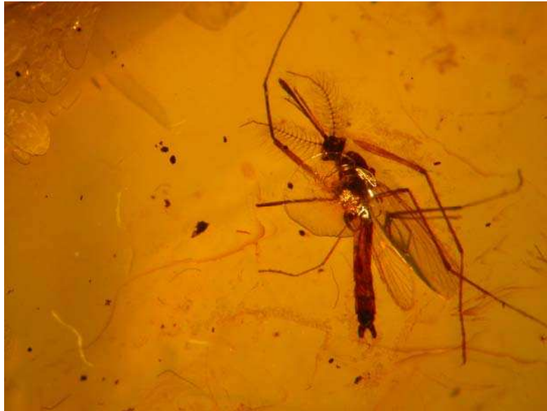
Fig. 14. Culicidae (Diptera), Aedes hoffeinsorum SZADZIEWSKI 1998, holotype male, dorsal habitus.