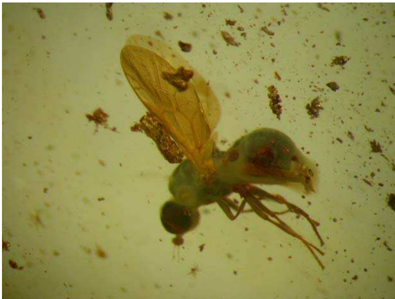
Fig. 8. Stratiomyiidae (Diptera), Pachygastrinae, female, lateral habitus, natural amber, body obscured by milky coating, coll. 1350-1.