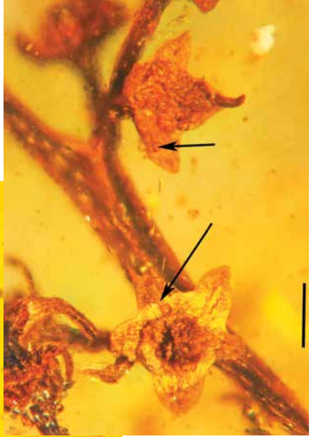
FIG. 2. Micropetasos burmensis . Two flowers in lateral and apical view. Upper arrow shows an anther of a long stamen lying against a calyx lobe. Lower arrow is on a ribbon-like filament of a long outer stamen. Note varying sizes of calyx lobes. Scale bar = 0.31 mm.