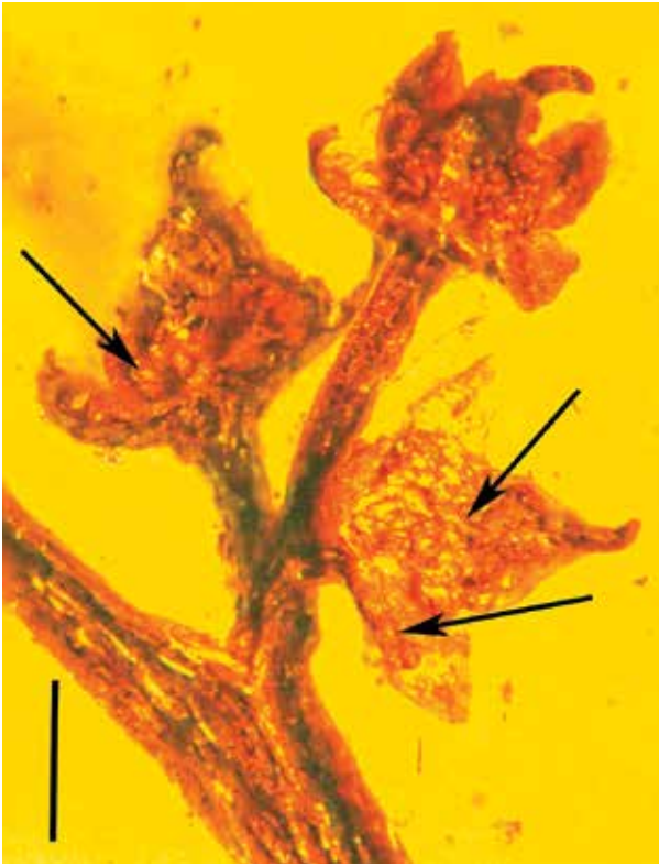
FIG. 3. Micropetasos burmensis . Group of 3 flowers on a short lateral branch of the inflorescence. Left arrow points to anther of a short outer stamen. Middle arrow at right is on a mass of long inner stamens appressed to the pistil. Lower arrow at right shows the linear filament of an elongated outer stamen. Note pistils with curved styles and the stout floral pedicels. Scale bar = 0.38 mm.